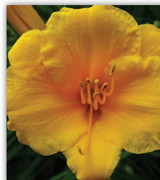
STELLA D'ORO DAYLILY