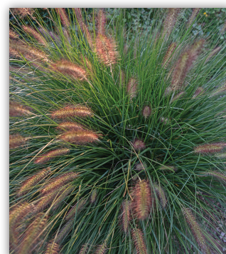
LITTLE BUNNY GRASS