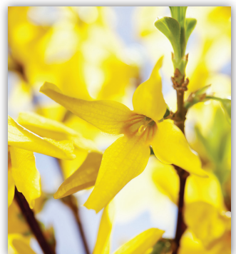
LYNWOOD GOLD FORSYTHIA