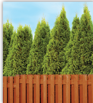
GREEN GIANT PYRAMIDAL ARBORVITAE (PAGE 12)