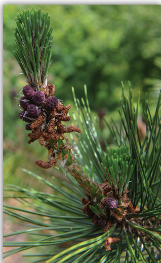
JAPANESE BLACK PINE