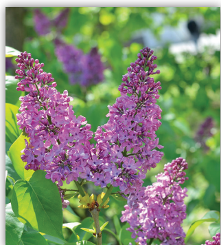
OLD FASHIONED LILAC