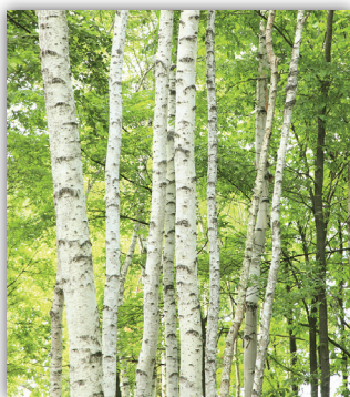
PAPER WHITE BIRCH

WHITE ASH ☀️🌑 Fraxinus americana • Zone 4-9 • Medium growth rate 50 to 80 feet. Upright oval growth habit. Dark green leaves in summer, changing to yellow to deep purple and maroon colors in fall. Deep, moist well drained soil, but can withstand soils which are not excessively dry and rocky. NO SHIPMENTS TO: AL, AK, AZ, AR, CA, CO, CT, DE, FL, GA, HI, ID, KS, LA, ME, MA, MN, MS, MT, NE, NV, NH, NM, NC, ND, OK, OR, PR, RI, SC, SD, TX, UT, VT, WA, WY.