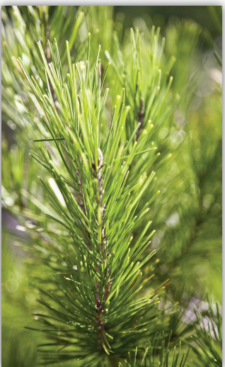
SPANISH SCOTCH PINE