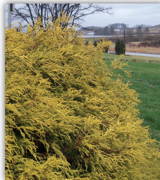
GOLD THREAD CYPRESS