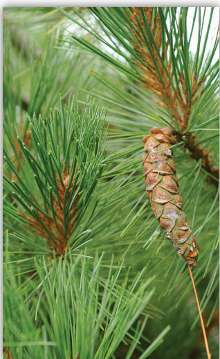
EASTERN WHITE PINE

Each year we produce a variety of native conifer and hardwood seedlings and transplants along with ground covers, landscaping shrubs, perennials and ornamental grasses. We offer the broadest selection of plant material available from one nursery. Musser Forests grown plants are shipped throughout the entire United States.