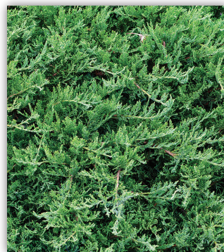
BLUE RUG JUNIPER