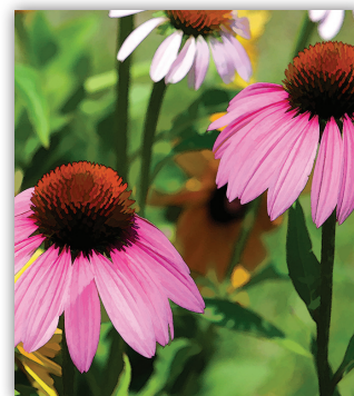
PURPLE CONEFLOWER (PAGE 14)