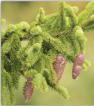
WHITE SPRUCE (PAGE 3)

BALSAM FIR ☀️🌿 Abies balsamea • Zone 3-5 • A narrow pyramidal growing to a height of 50 to 75 feet; spread 20 to 25 feet. Prefers moist, well drained, acidic soil. Adapts well to cooler climates. Prized for its fragrance as a cut tree. Extensively used for Christmas trees and ornamentals. Needs very little shearing.