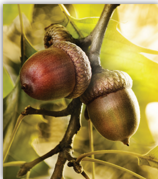
RED OAK ACORNS (FALL)