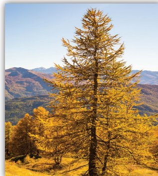
EASTERN LARCH (FALL COLOR)