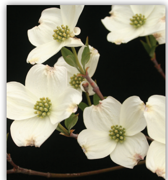
WHITE FLOWERING DOGWOOD