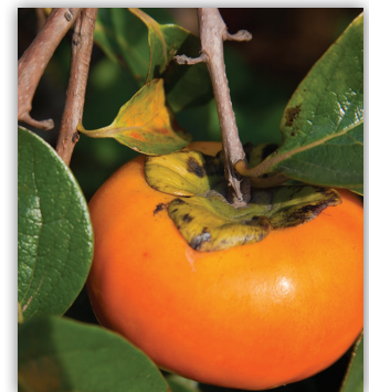
AMERICAN COMMON PERSIMMON