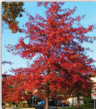
PIN OAK (FALL COLOR)