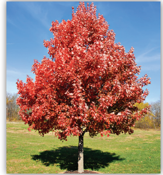
RED MAPLE (FALL COLOR)