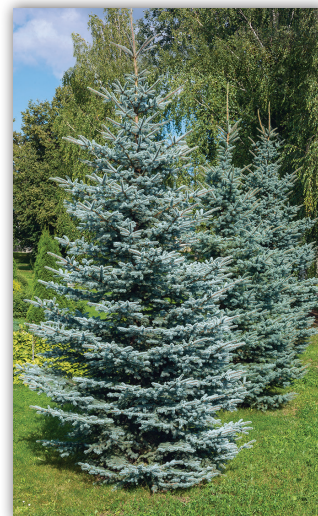
COLORADO BLUE SPRUCE