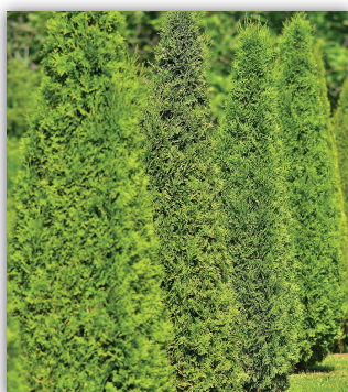
EMERALD GREEN PYRAMIDAL ARBORVITAE