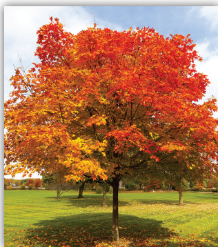
RED OAK (FALL COLOR)