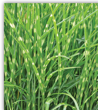
DWARF PORCUPINE GRASS