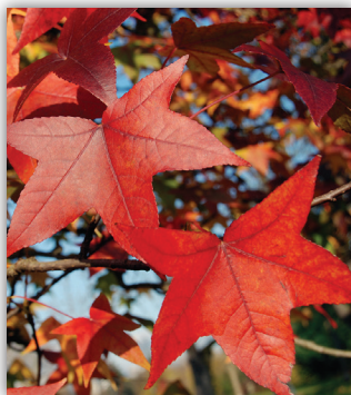
AMERICAN SWEETGUM (FALL COLOR)

NEW! AMERICAN SWEETGUM ☀ Liquidambar styraciflua • Zone 5-9 • Also known as the Alligator Tree due to the gray, deeply furrowed, scaly ridges of its bark. An aromatic, deciduous tree growing in a very symmetrical pyramidal form to a height of 40 to 75 feet. Branches spread in a horizontal fashion to 30 to 35 feet. A native easily recognized by its star-shaped leaves which are either five or seven pointed, toothed lobes. Squirrels often caught hoarding the prickly seedballs which persist into winter.