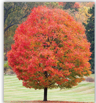
SUGAR MAPLE (FALL COLOR)