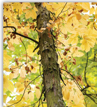
SHAGBARK HICKORY (FALL COLOR)