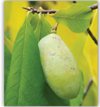
PAW PAW (PAGE 10)